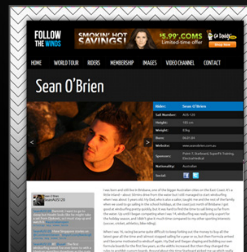
Rider Profile Page