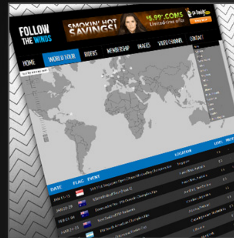
World Tour Calendar