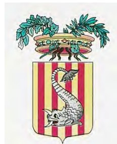
Provincia di Lecce