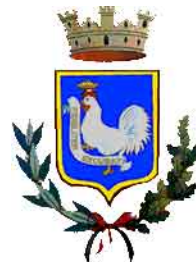
Città di Gallipoli