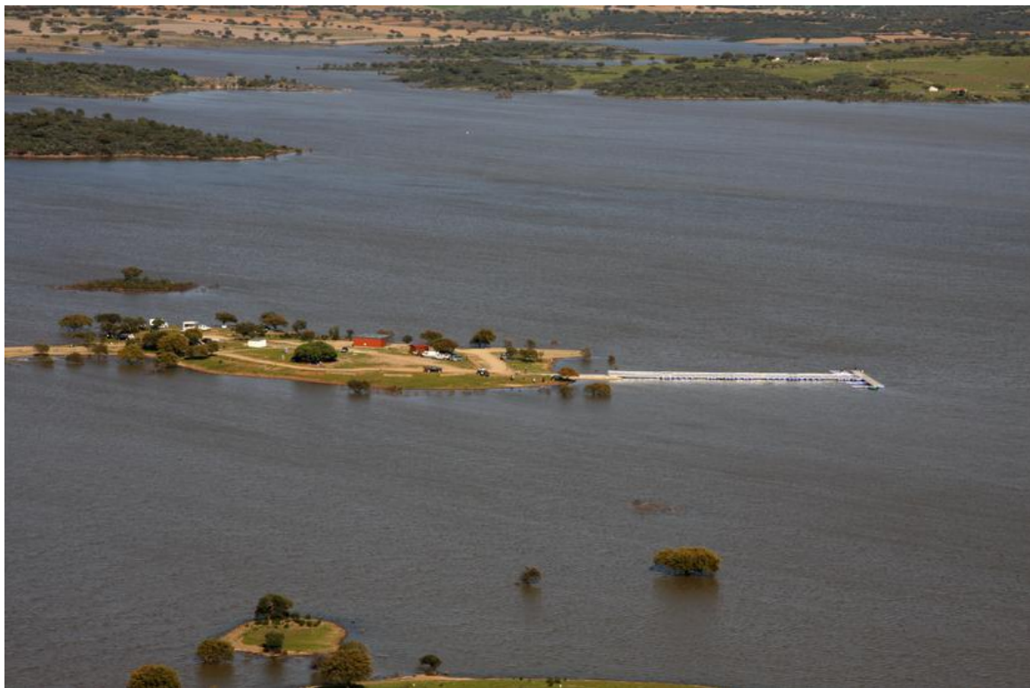
Race Office (Centro Náutico Reguengos de Monsaraz) and Camping area.