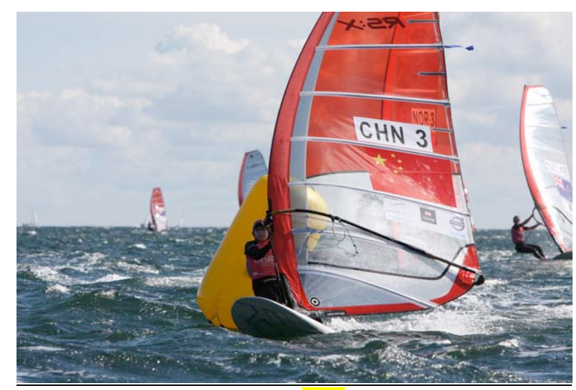
An online Audience of 85 Countries For The RS:X World Championships